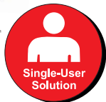
Universal Signal Booster 805221