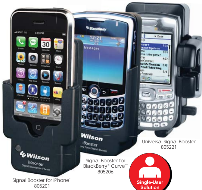
Signal Booster for iPhone® 805201