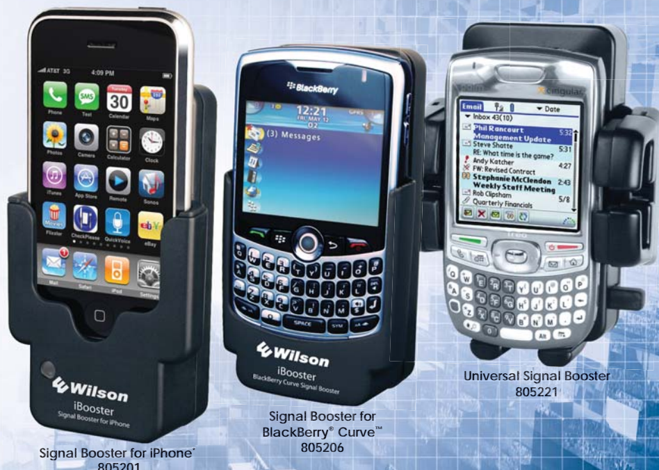
Signal Booster for iPhone™ 805201

INCREASES POWER TO THE CELL SITE UP TO 20 TIMES OVER THE CELL PHONE ALONE